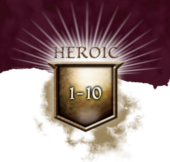
illustration by Howard Lyon cartography by Jered Blando