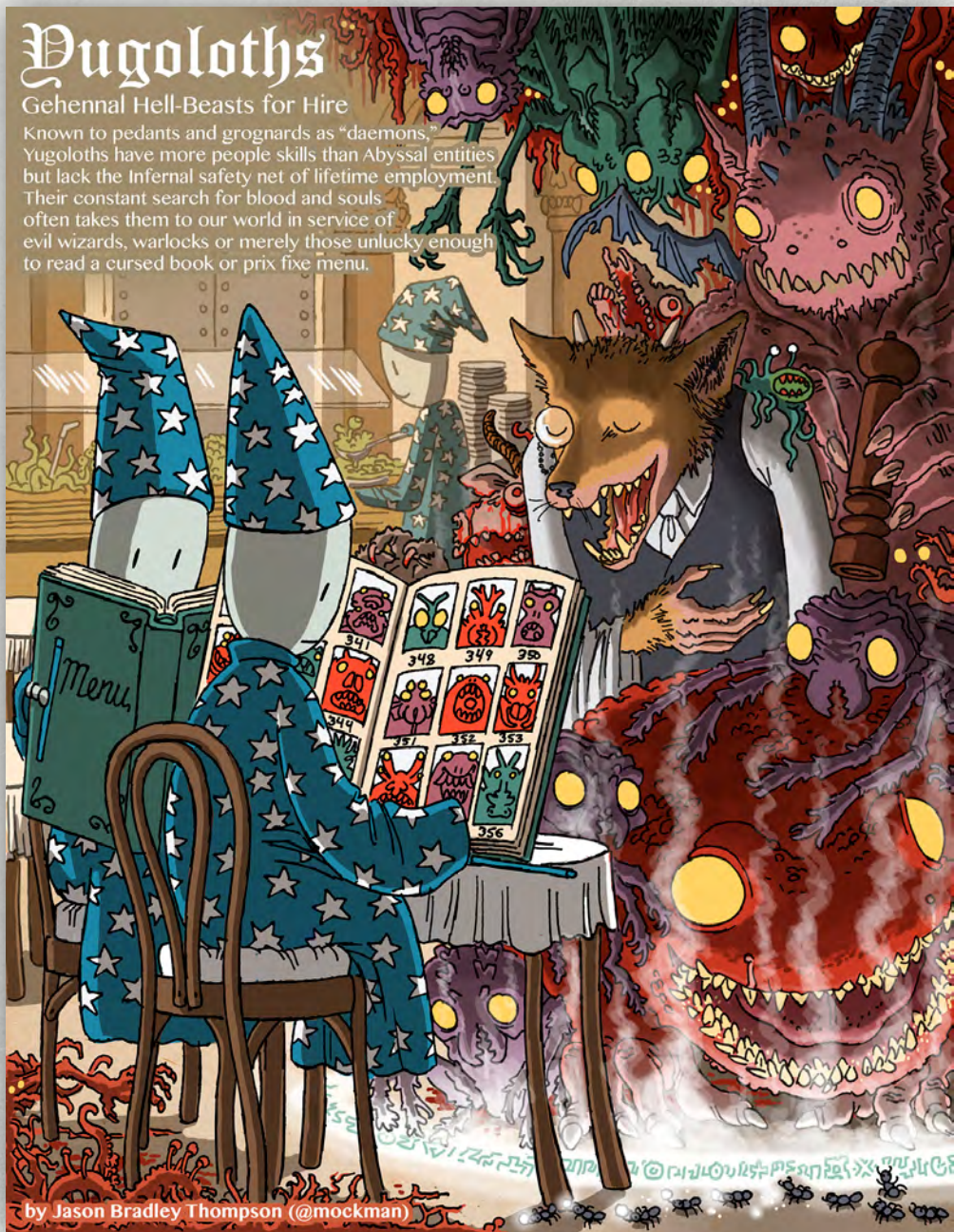
by Jason Bradley Thompson (@mockman)

The summoned vampiric mists understand your language and obey your spoken commands. If you issue no commands, they attack all nearby humanoids