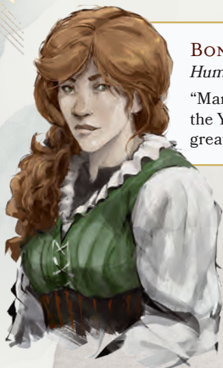
BONNIE Human barmaid

"Many adventurers pass though the Yawning Portal on their way to greatness. All of them try the ale."