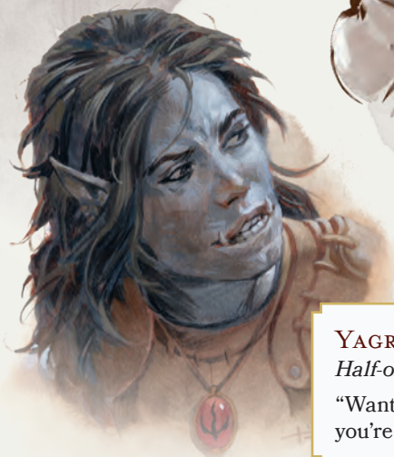
YAGRA STONEFIST Half-orc mercenary

"The wonders of Waterdeep are something to behold. I tell you, I've never seen so much money in my life!"