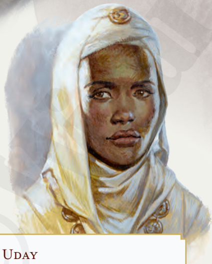
OBAYA UDAY Human cleric of Waukeen

"The wonders of Waterdeep are something to behold. I tell you, I've never seen so much money in my life!"