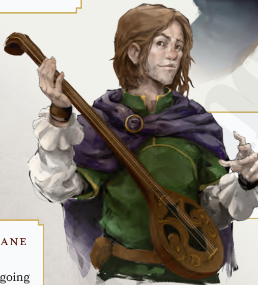
"THREESTRINGS" Human bard

"I'll give you a free flagon of ale if you don't talk to me about the weather."